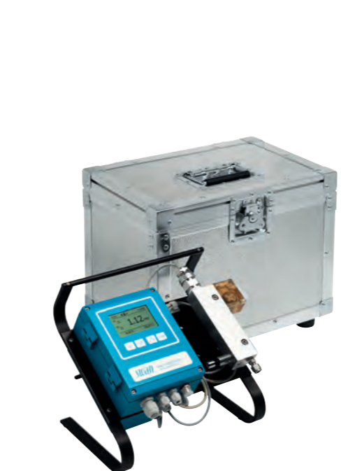
For Quality Assurance incl. carrying case (pH, Conductivity, Resistivity, O2).