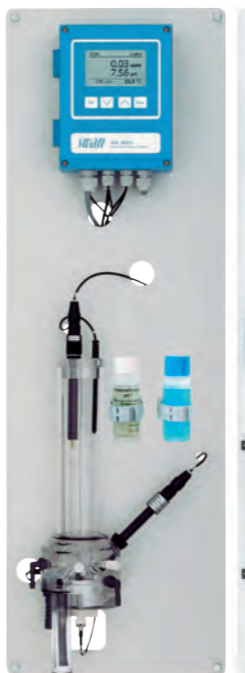
Cl, O3 and other disinfectants.