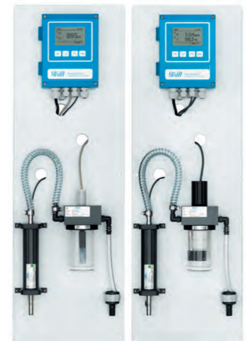
Fouling-free four-wire sensor. PPM-Levels for aeration control.