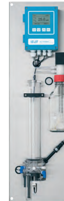
Set-up for high purity water.