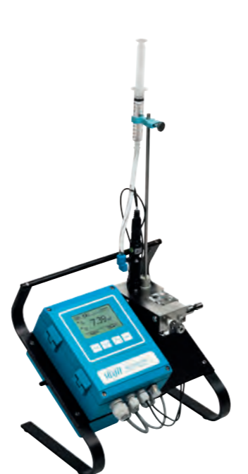
For Quality Assurance pH