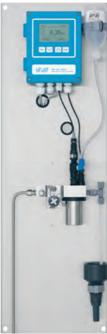
Specific, total or direct conductivity.