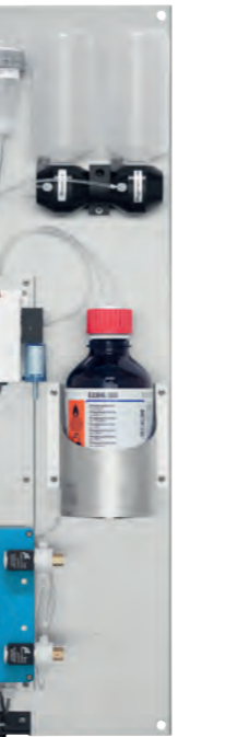
Automatic multiple known addition calibration.