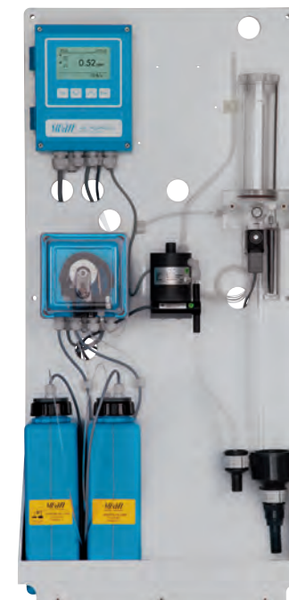
Process photometer without silica interference.