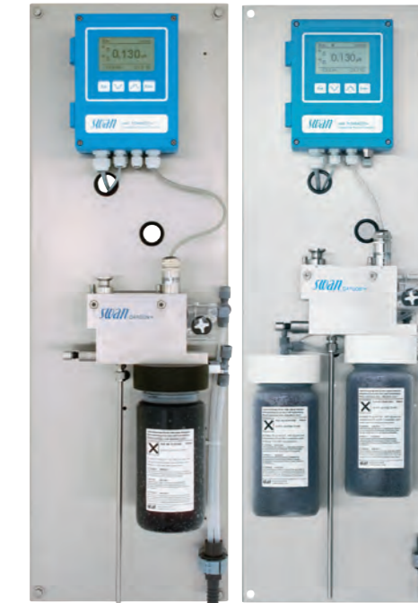
With integrated cation column.