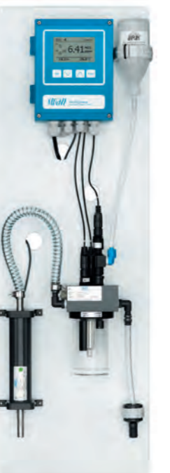
Ion sensitive measurement