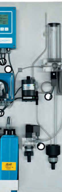
Built-in quality assurance.