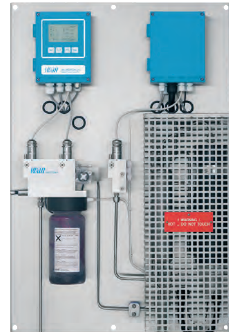
Specific, acid and degassed acid conductivity with re-boiler.