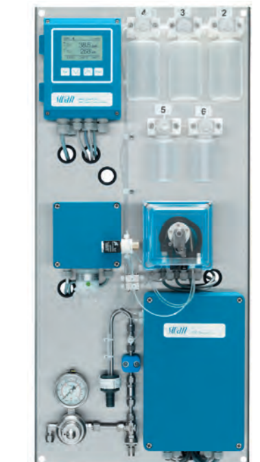
Reagent-free measurement with automatic addition and dilution.