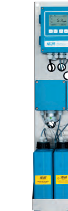
Precision photometer with built-in stream switching.