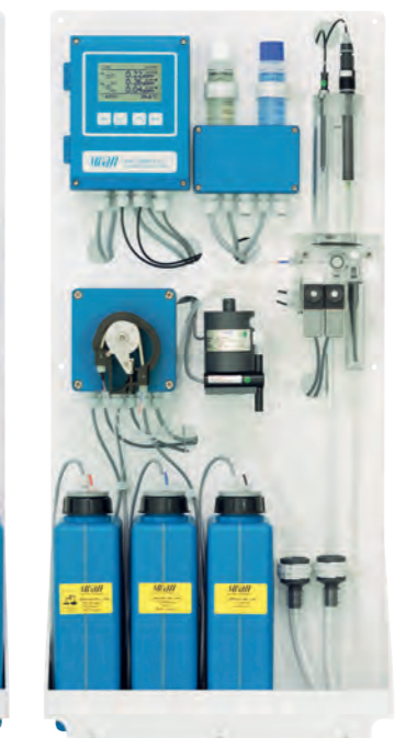
DPD Method. Free, Total and Combined Chlorine.