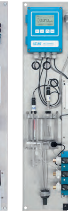
With passive reagent addition.