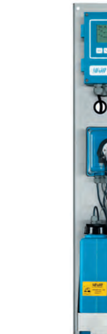
Non contact photometer with low maintenance.