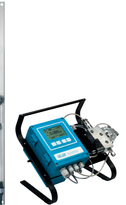
With pre-rinsed back-up column.