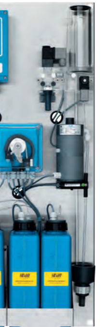
Process photometer without silica interference.