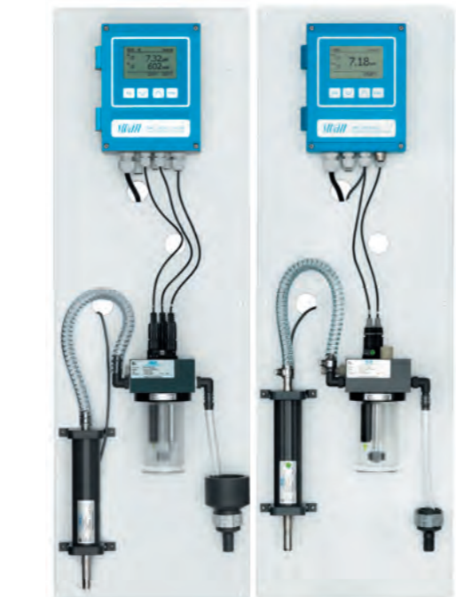
Combined pH & ORP measurement with flow monitoring