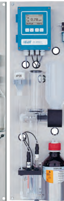
Hydrazine or carbonylhydrazide.