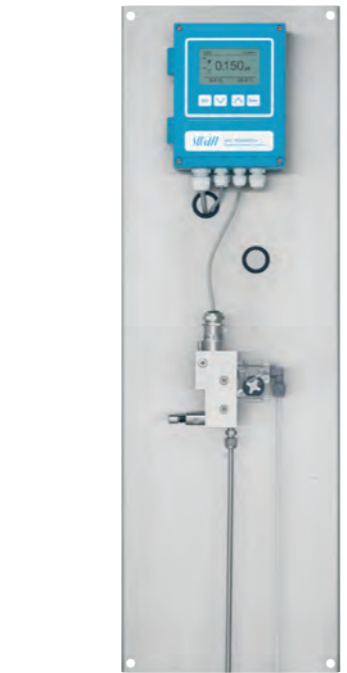
For Quality Assurance conductivity