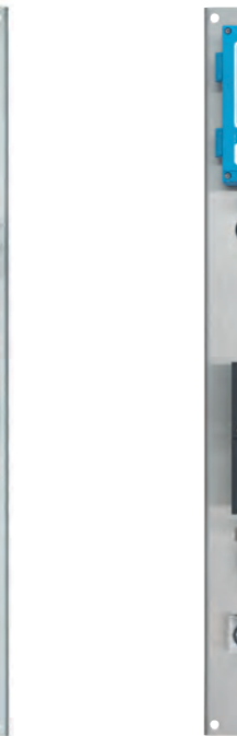
High resolution for 18 MΩ water.