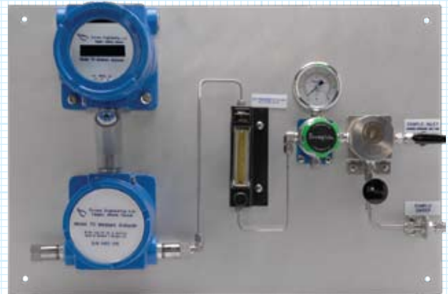
M70 with standard sample system mounted on 16" by 24" anodized aluminum panel