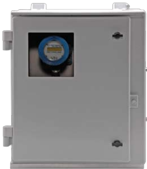
M70 with Insulated Housing Option